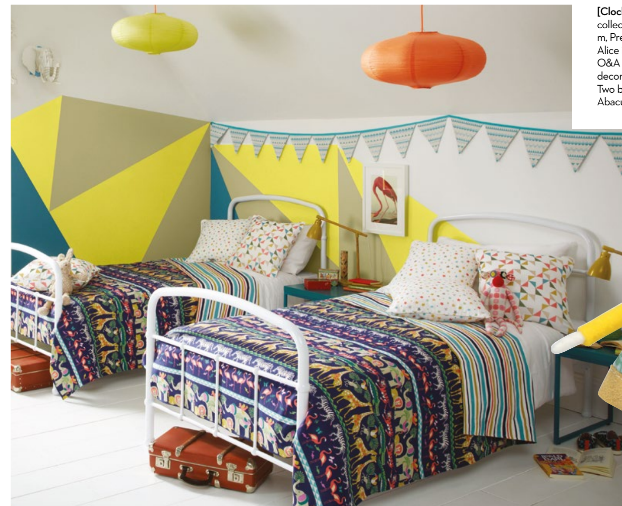
[Clockwise from top left] My World collection, from approx £21.36 per m, Prestigious Textiles; bespoke Alice in Wonderland bedroom by O&A Design; Mrs Bunny Easter decoration, £10, Ella James; bedding: Two by Two, Harley, Multi Stars, and Abacus, all from £22 per m, ILIV