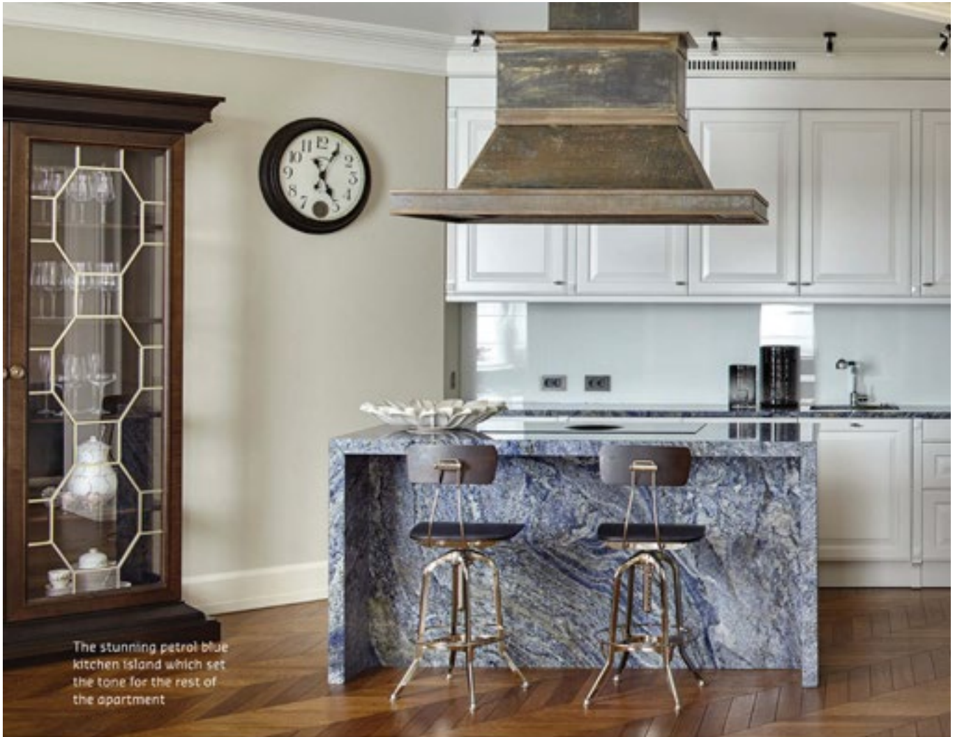
The stunning petrol blue kitchen island which set the tone for the rest of the apartment