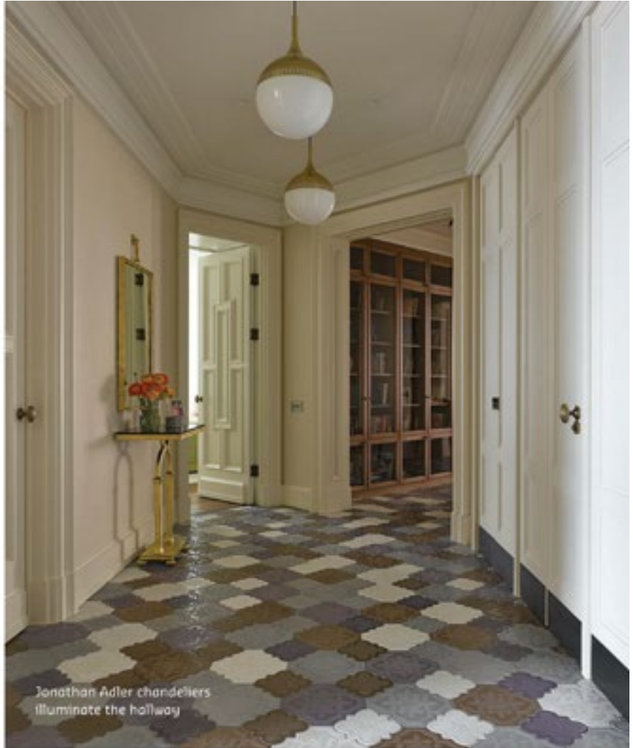
Jonathan Adler chandeliers illuminate the hallway

One of the children's bedrooms has brightly coloured wallpaper behind the bedhead, with colourful zebras all in different postures. The tall shape of the zebras is reflected in