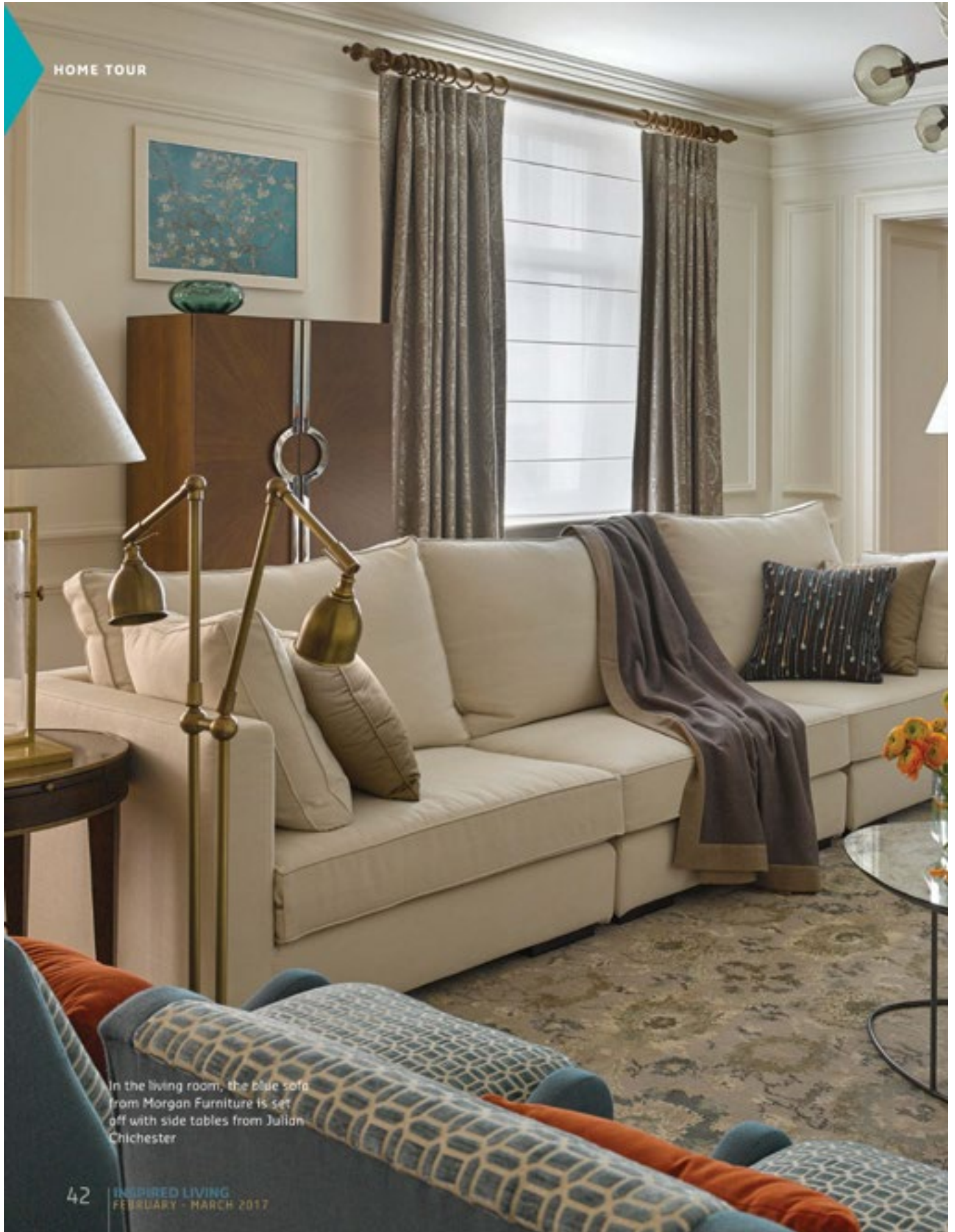
In the living room, the blue sofa from Morgan Furniture is set off with side tables from Julian Chichester