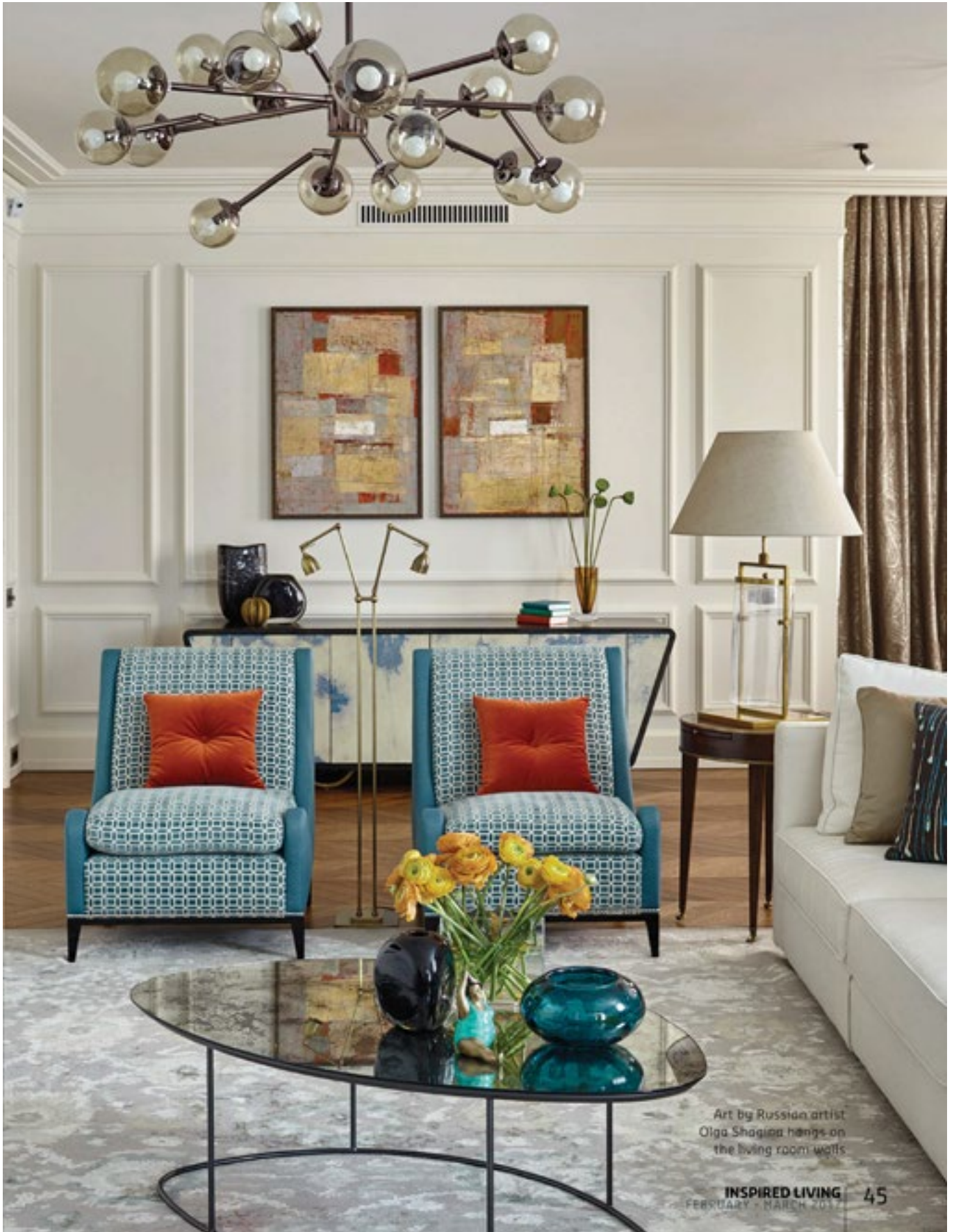
Art by Russian artist Olga Shagina hangs on the living room walls