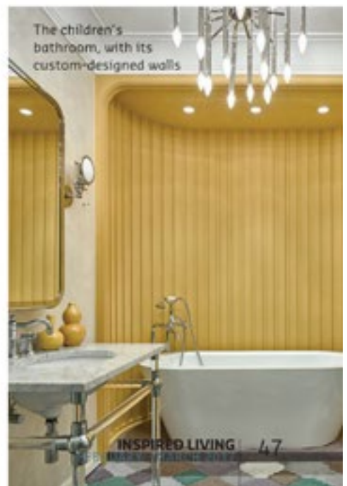
The children's bathroom, with its custom-designed walls