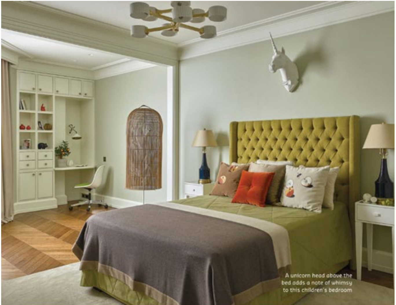
A unicorn head above the bed adds a note of whimsy to this children's bedroom