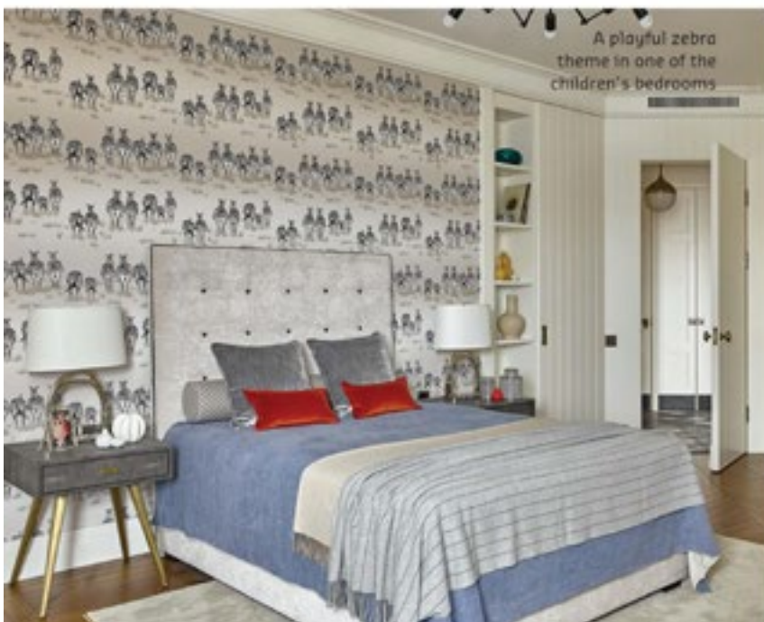
A playful zebra theme in one of the children's bedrooms